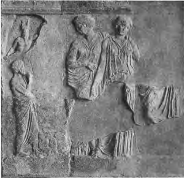
Fig. 52. Votive Offering to Pan and the Nymphs.

tude were mourning. The Christian tradition told that this was about the time of Christ's death, and that the mysterious voice announced the end of the gods of Greece, who withdrew lamenting before the cross of Christ.